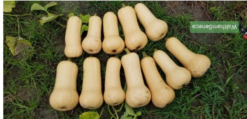
Waltham – Seneca strain