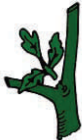
Fig. 4. Prune tomatoes by removing small side shoots or suckers as they grow.