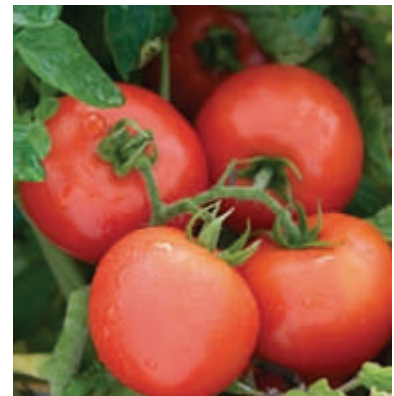
Defiant, Johnny's Selected Seeds

Green Zebra- 75 days- Green and yellow striped, medium size fruit, mild, sweet acidic flavor.