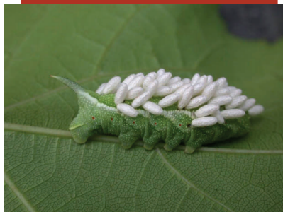
Braconid wasp pupae covering the back of a tobacco hornworm.