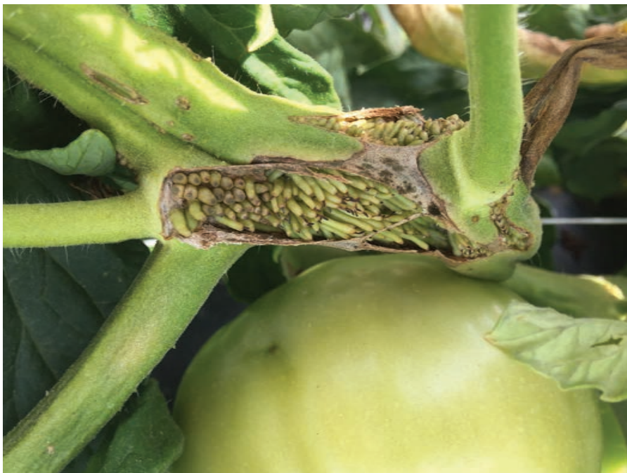
Right: Pith necrosis symptom tomato.