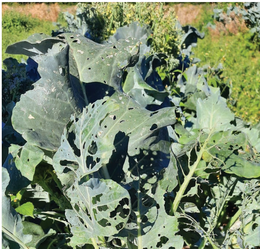
Right: Caterpillar damage on 'Marathon' broccoli.