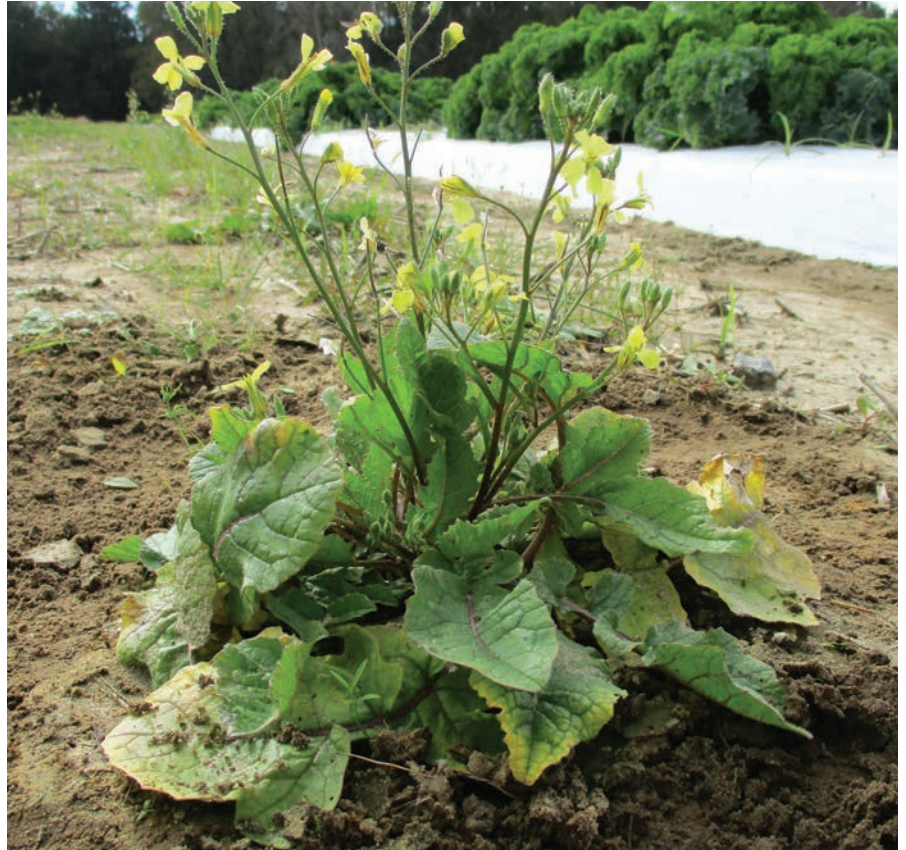
Right: Wild Mustard